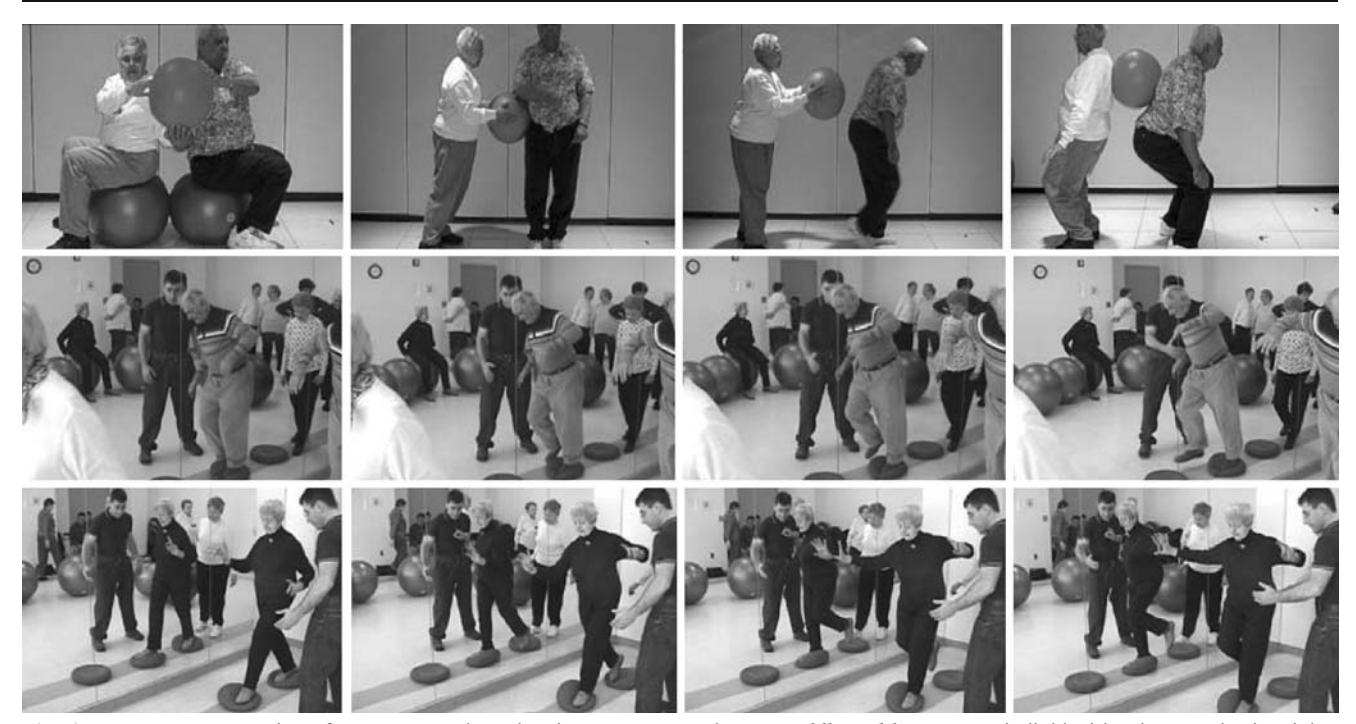
Fig. 2 Upper row, examples of partner exercises that incorporate elements from level 5 where the subjects must negotiate expected and unexpected external perturbations of posture. Note that the subject is out of balance and in the process of executing a step in the third