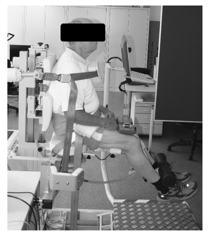
Fig. 1 Participant placed in the Dr. Wolff ISO Check for knee extension measurement

The initiation of torque increase was defined as the point at which each torque value increased (delta=0.01 N m s<sup>-1</sup>) over the following 15 consecutive time points. Maximum torque (MT: in newton meters) was determined by the peak value of the torque time curve. The maximum rate of torque development (MRTD: in newton meters per second; see Fig. 3) was computed by differentiating the torque time curve and determining the maximum slope of the curve [17, 36]. When comparing data between the two sessions (reliability and influence of pretension), the average value of the two trials per condition was used. Additionally, the average was also recorded from the two trials within each day, for analysis.